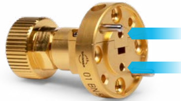
Two extra pin holes to ensure precise alignment