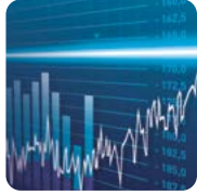
TEST &amp; MEASUREMENT

For more than 75 years, the SPINNER Group has been setting new standards worldwide in high-frequency technology. Based in Munich with production facilities in Germany, Hungary and China, SPINNER currently has over 900 employees. Our international network of subsidiaries and distributors supports customers in over 40 countries.