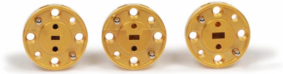
SPINNER mmWave waveguide-to-coaxial adapters