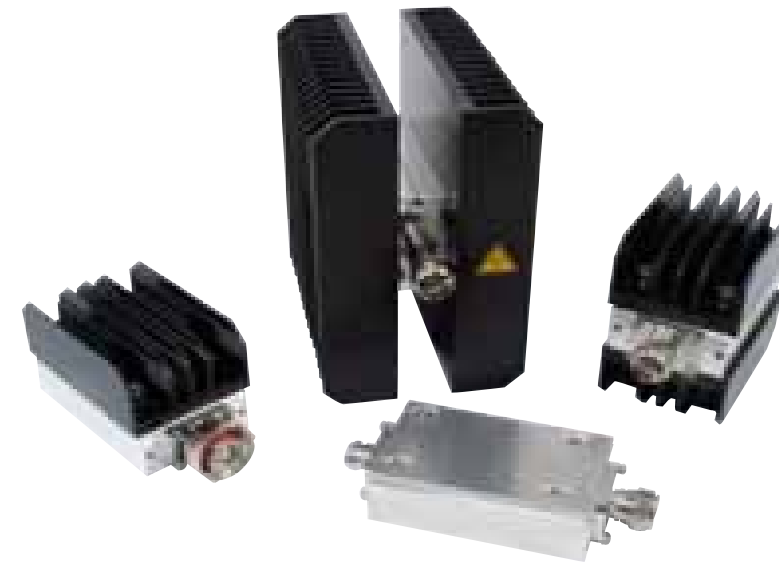
(ATTENUATOR FAMILY 'GREEN LINE')

Especially, when vector network analyzers are used, high-precision connectors, terminations and adapters are indispensable. The same applies to calibration kits and mechanical accessories such as gauges for checking the mating face dimensions or torque wrenches for tightening coupling nuts. In manufacturing such components SPINNER has reached a level of precision which sets new standards which many users would not want to be without.