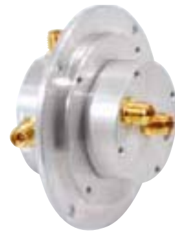
KA-BAND, DUAL CHANNEL, L-STYLE FOR SATCOM APPLICATIONS

To find the right solutions for the customer has always been an important aspect for SPINNER. Only if the customer